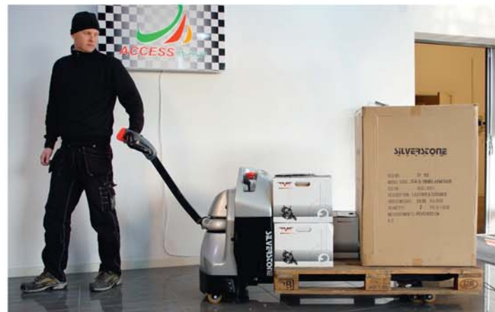
T20-18ET is a helping hand in the warehouse.